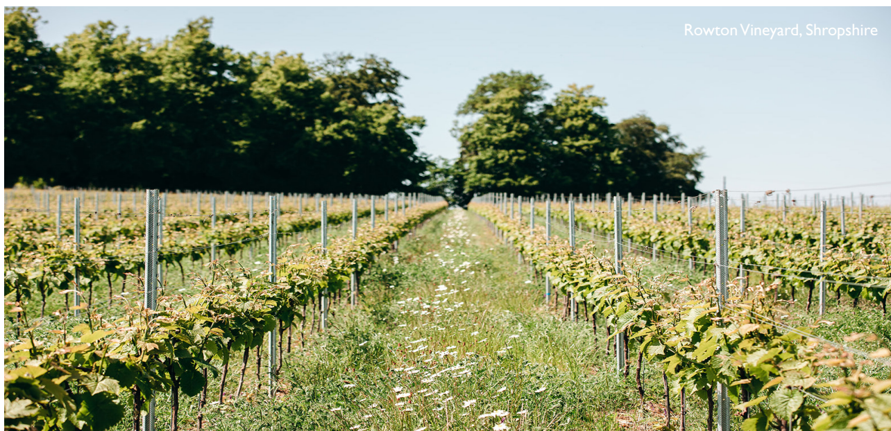
Rowton Vineyard, Shropshire