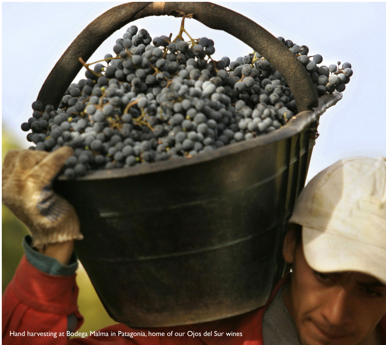
Hand harvesting at Bodega Malma in Patagonia, home of our Ojos del Sur wines