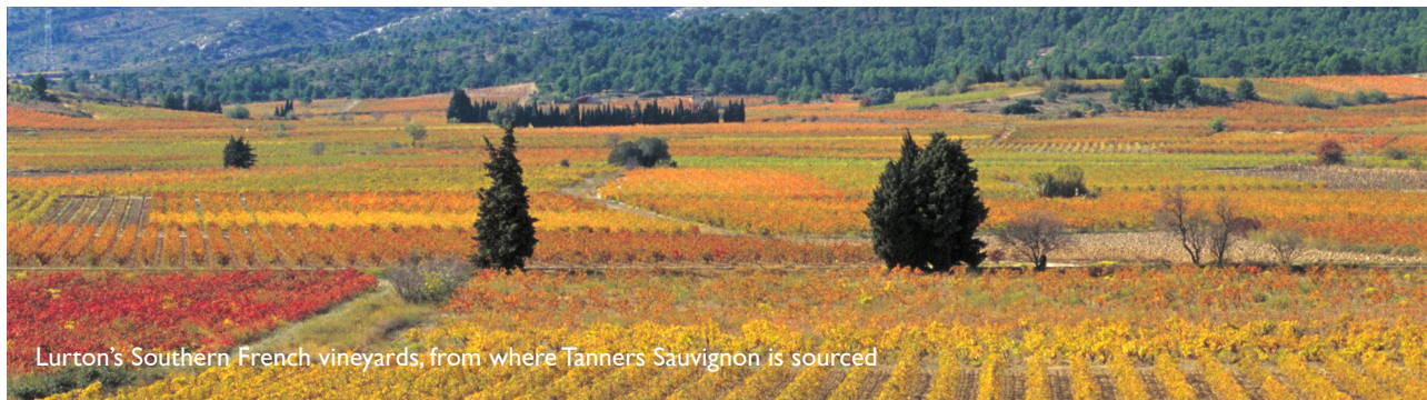
Lurton's Southern French vineyards, from where Tanners Sauvignon is sourced